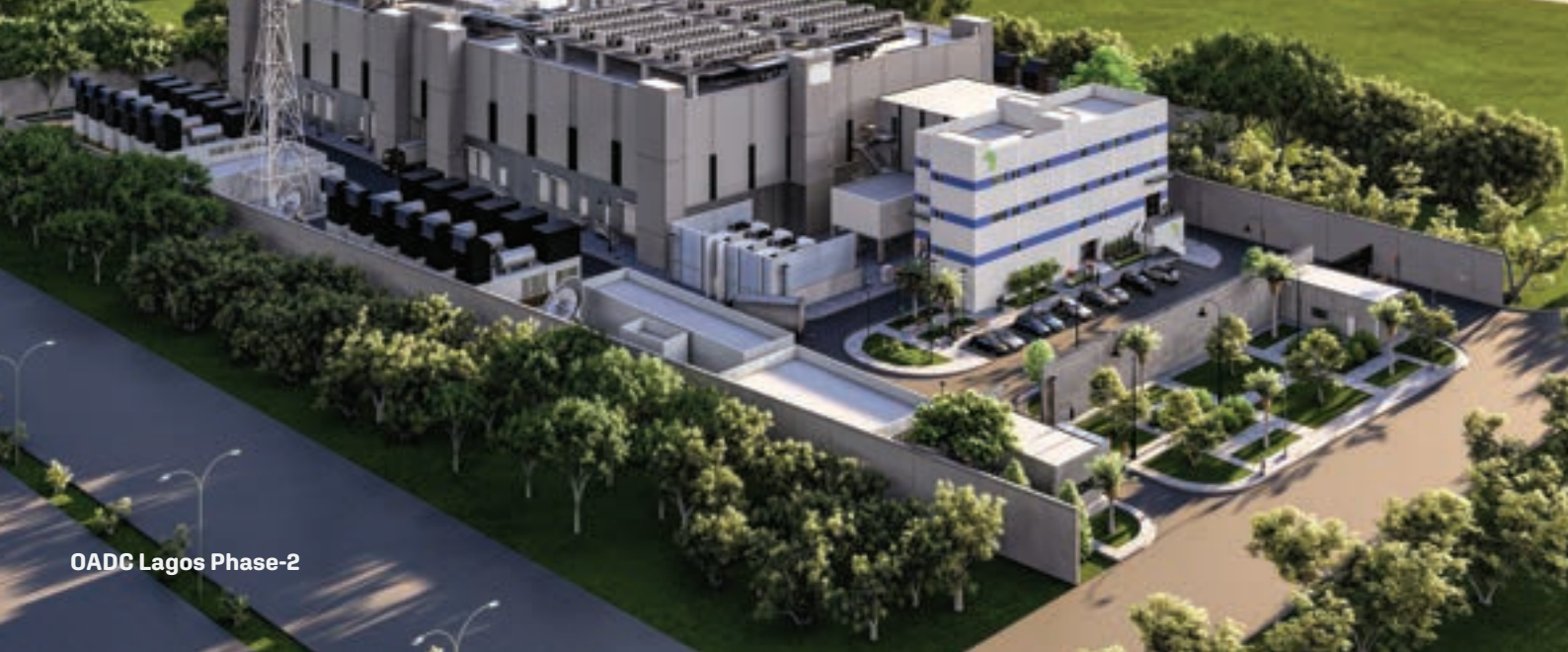
OADC Lagos Phase-2